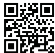
Menus & allergen icons

Saint Mary's has a number of students who need to follow a gluten free (GF) diet. We have options to accommodate GF students in the dining hall. Starting with our line cards, many of our regular dining hall items are naturally gluten-free. Many of our students simply refer to these line cards to navigate their dining hall choices. Of course this does not prevent cross-contamination of naturally gluten-free foods once they are out on the dining hall lines. For this reason we are happy to hold portions of some items back in the kitchen to eliminate that risk. We also have a special gluten free area in the dining hall. Students usually take items from this area then head out to the general dining room to gather other items to complete their meal. As with food allergies, we can also specially prepare gluten-free meals for students who coordinate with the College's dietitian. Additionally, deep-fried foods have a higher rate of cross-contamination and we generally advise against their consumption.