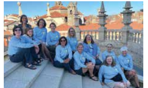
Friends enjoyed a trip to complete a portion of the Camino de Santiago in Spain. Here they are on top of the Cathedral in Santiago de Compostela.